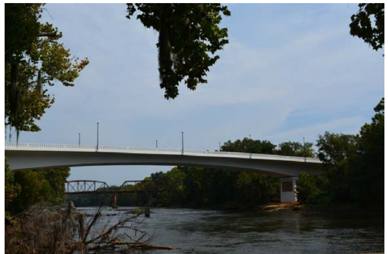
Broad Avenue Memorial Bridge - Segmental Concrete Box Girder Bridge Construction 9-21-15

On August 31, 2015, an inspection of the bridge was performed by representatives of the Georgia Department of Transportation (GDOT) and the Federal Highway Administration (FHWA). A list of items that need to be addressed by the contractor was provided to PCL Constructors on September 8 th . Once the punch list items are corrected or completed, GDOT and FHWA will inspect the bridge again. If this inspection determines that the construction meets the design specifications and drawings, the bridge be accepted and will become the responsibility of the City of Albany.