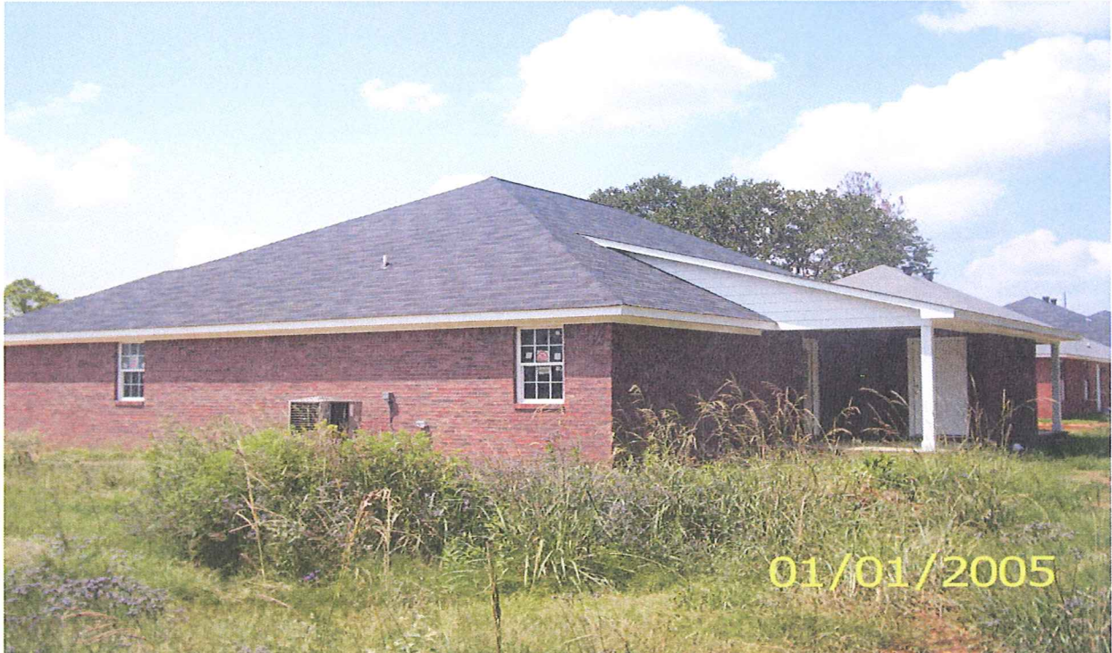
LEFT SIDE + FRONT VIEW